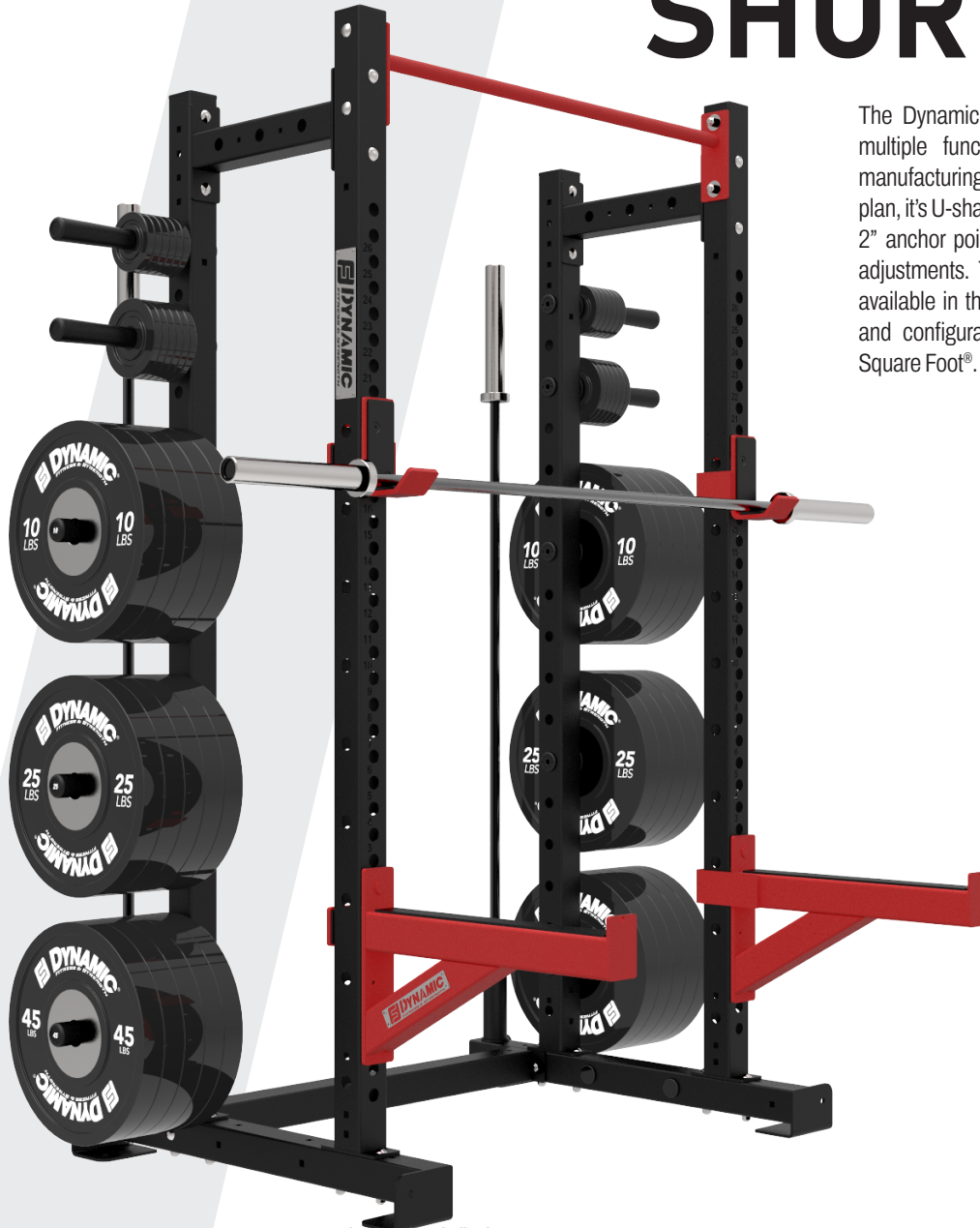
Bumper plates and Barbells shown for display purposes only. Not included with unit.

The Dynamic Fitness & Strength Titan Series rack offers multiple functions and capabilities built upon superior manufacturing and design. Allowing for a more open floor plan, it's U-shaped base offers more stand-alone support. The 2" anchor points provide super-efficient and precise height adjustments. The full line of accessories and attachments available in the Titan Line provides almost limitless options and configurations to literally provide More Strength Per Square Foot®.