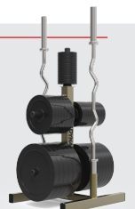
Bumper and Bar Storage Options