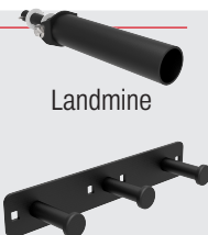
Bolt-on Band Pegs