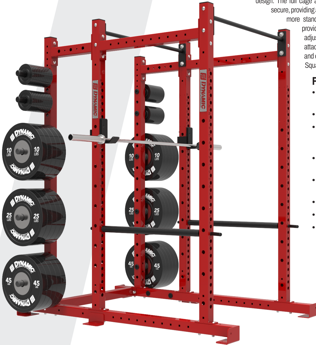
Bumper plates and Barbells shown for display purposes only. Not included with unit.

The Dynamic Fitness & Strength Titan Series Power Rack offers multiple functions and capabilities built upon superior manufacturing and design. The full cage allows for self-spotting arms to be more secure, providing additional safety. It's U-shaped base offers more stand-alone support. The 2" anchor points provide super-efficient and precise height adjustments. The Titan accessories and attachments provide almost limitless options and configurations, offering More Strength Per Square Foot®.