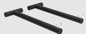
Band Peg Accessories