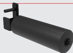
Single Leg Squat Roller

Maximize your Rack or Rig with many accessory & attachment options.