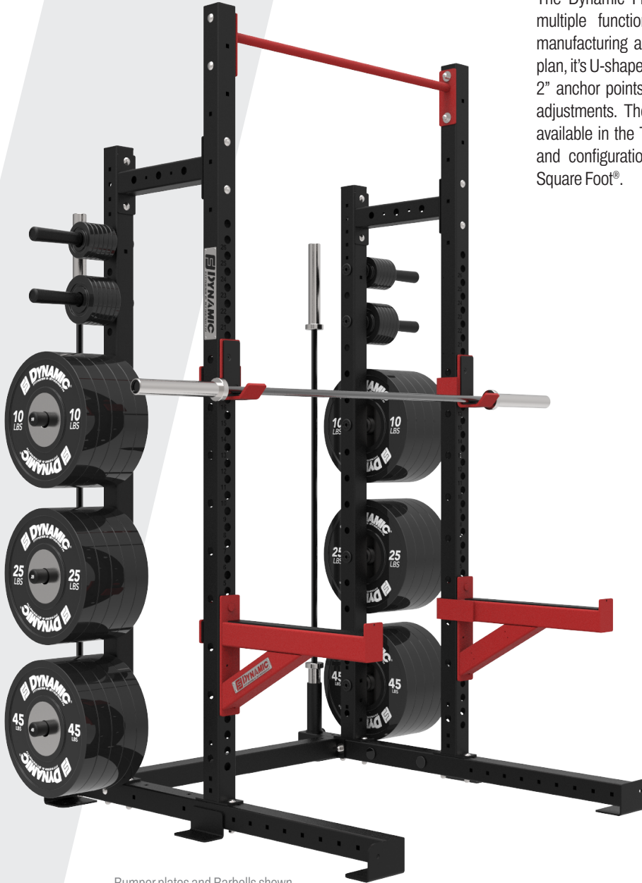
Bumper plates and Barbells shown for display purposes only. Not included with unit.

The Dynamic Fitness & Strength Titan Series rack offers multiple functions and capabilities built upon superior manufacturing and design. Allowing for a more open floor plan, it's U-shaped base offers more stand-alone support. The 2" anchor points provide super-efficient and precise height adjustments. The full line of accessories and attachments available in the Titan Line provides almost limitless options and configurations to literally provide More Strength Per Square Foot®.