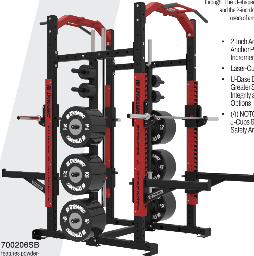
700206SB features powder-coated upright wraps

Superior quality and presentation featuring double the function and capacity. The Ultra Pro Series Double Half Rack with single-post storage will maximize your floor space while its heavy-gauge steel frame will endure whatever your heaviest lifters put it through. The U-shaped base provides additional stand-alone support and the 2-inch lock notch anchor points offer settings just right for users of any size.