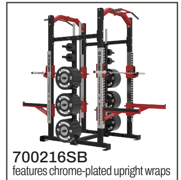
700216SB features chrome-plated upright wraps