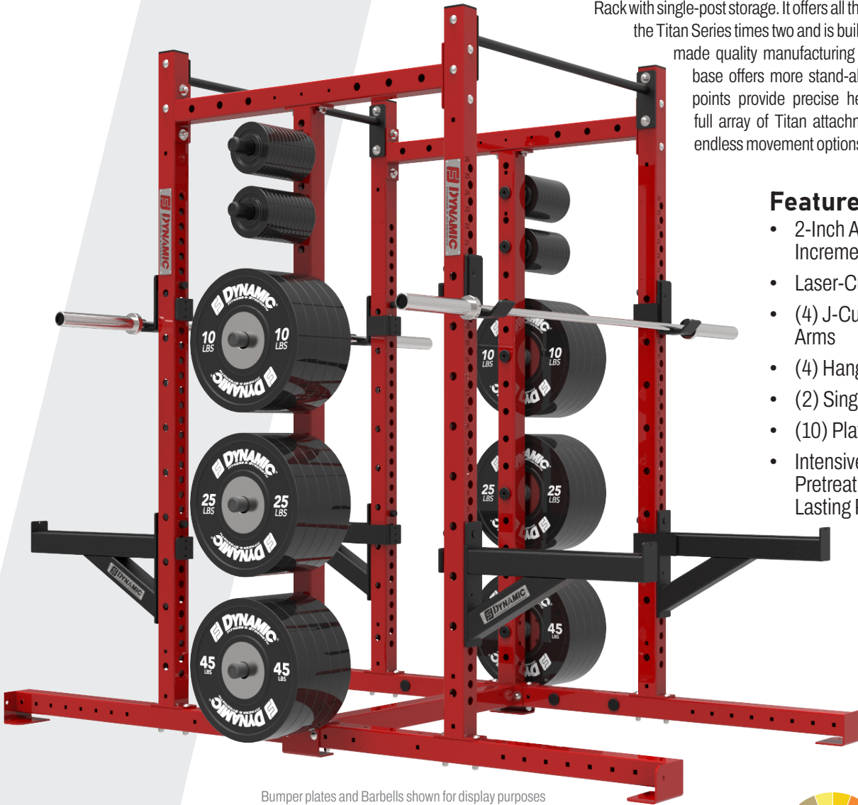
Bumper plates and Barbells shown for display purposes only. Not included with unit.

Save floor space with the Dynamic Fitness & Strength Titan Series Double Half Rack with single-post storage. It offers all the function and capabilities of the Titan Series times two and is built upon Dynamic's American-made quality manufacturing and design. The U-shaped base offers more stand-alone support and 2" anchor points provide precise height adjustments. Add the full array of Titan attachments and you have almost endless movement options.