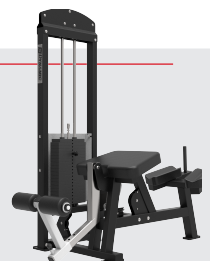
Prone Leg Curl