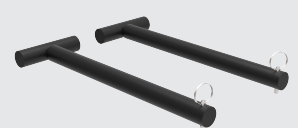
Band Peg Accessories