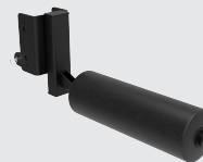
Split Squat Roller