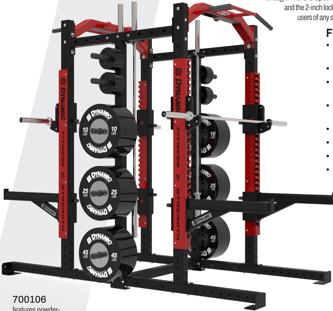
700106 features powder-coated upright wraps