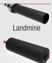
Split Squat Roller