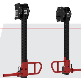
Athletic Training Arms

Increase the functionality of your rack with these and more Titan accessories & attachments.