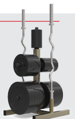
Bumper and Bar Storage Options