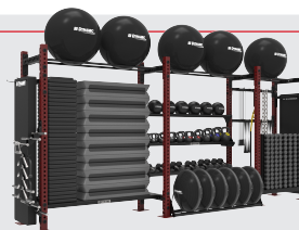
Annex Storage Options