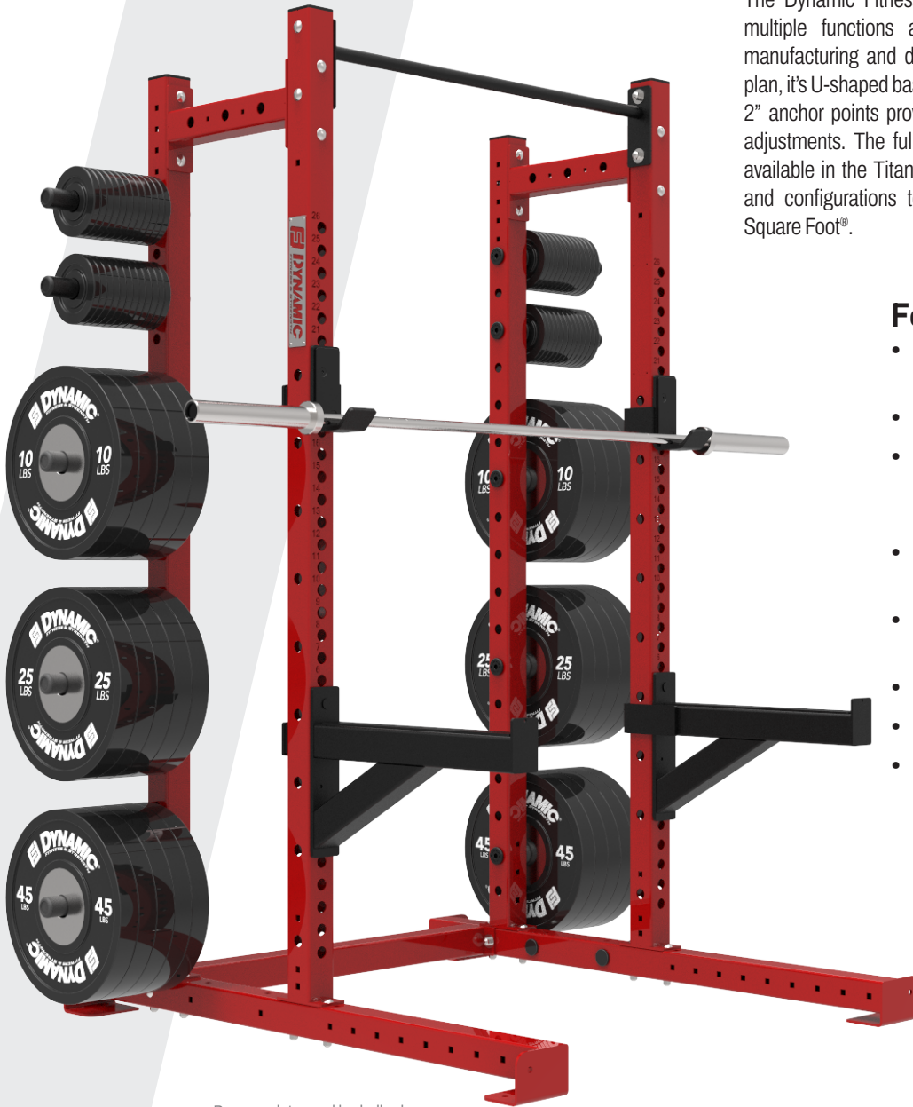
Bumper plates and barbells shown for display purposes only. Not included with unit.

The Dynamic Fitness & Strength Titan Series rack offers multiple functions and capabilities built upon superior manufacturing and design. Allowing for a more open floor plan, its U-shaped base offers more stand-alone support. The 2" anchor points provide super-efficient and precise height adjustments. The full line of accessories and attachments available in the Titan Line provides almost limitless options and configurations to literally provide More Strength Per Square Foot®.