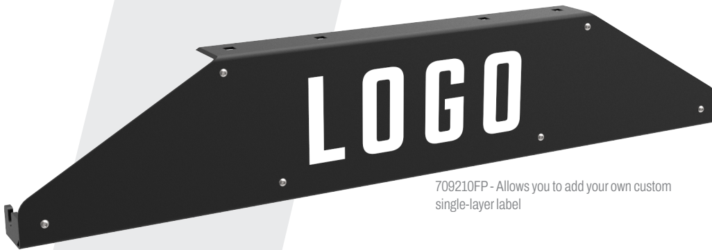
709210FP - Allows you to add your own custom single-layer label