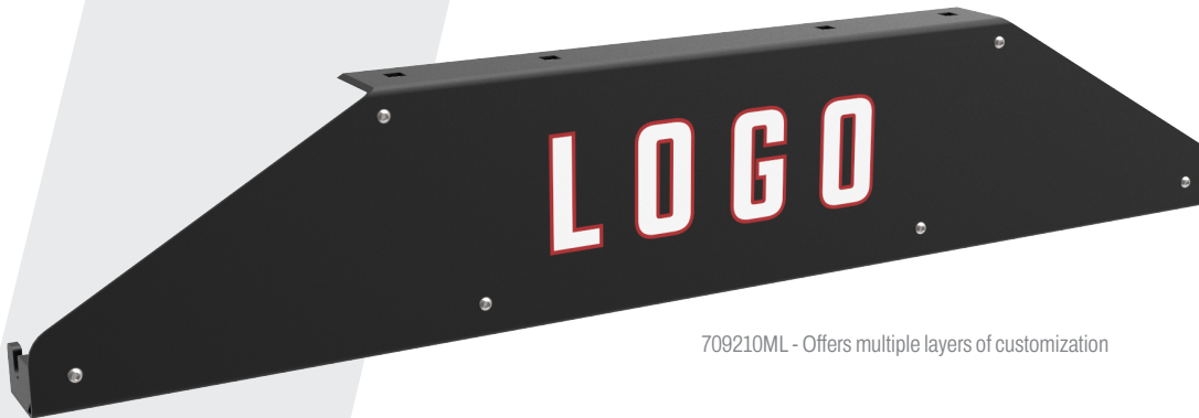
709210ML - Offers multiple layers of customization