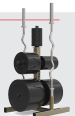
Bumper and Bar Storage Options