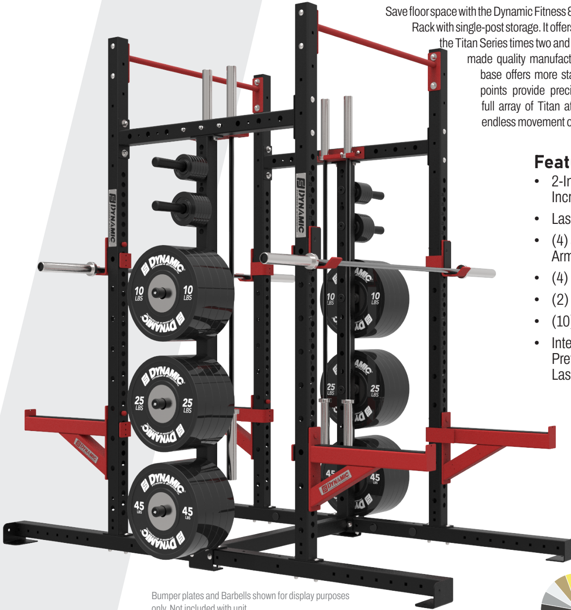
Bumper plates and Barbells shown for display purposes only. Not included with unit.

Save floor space with the Dynamic Fitness & Strength Titan Series Double Half Rack with single-post storage. It offers all the function and capabilities of the Titan Series times two and is built upon Dynamic's American-made quality manufacturing and design. The U-shaped base offers more stand-alone support and 2" anchor points provide precise height adjustments. Add the full array of Titan attachments and you have almost endless movement options.