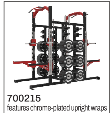
700215 features chrome-plated upright wraps

Bumper plates and Barbells shown for display purposes only. Not included with unit.