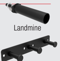
Bolt-on Band Pegs