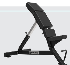
Lumbar Utility Bench