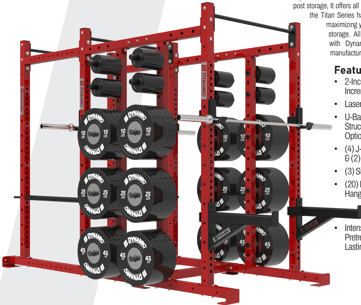
Bumper plates and Barbells shown for display purposes only. Not included with unit.

Optimize floor space by combining the open functionality of a half rack with the added safety of the caged Power Rack with the Dynamic Fitness & Strength Titan Series Combo DP rack. Featuring double-post storage, it offers all the function and capabilities of the Titan Series half rack and power rack, while maximizing your layout and increasing plate storage. All this functionality is delivered with Dynamic's American-made quality manufacturing and design.