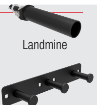
Bolt-on Band Pegs