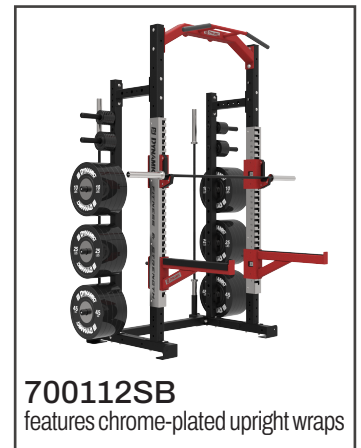
700112SB features chrome-plated upright wraps

Bumper plates and Barbells shown for display purposes only. Not included with unit.