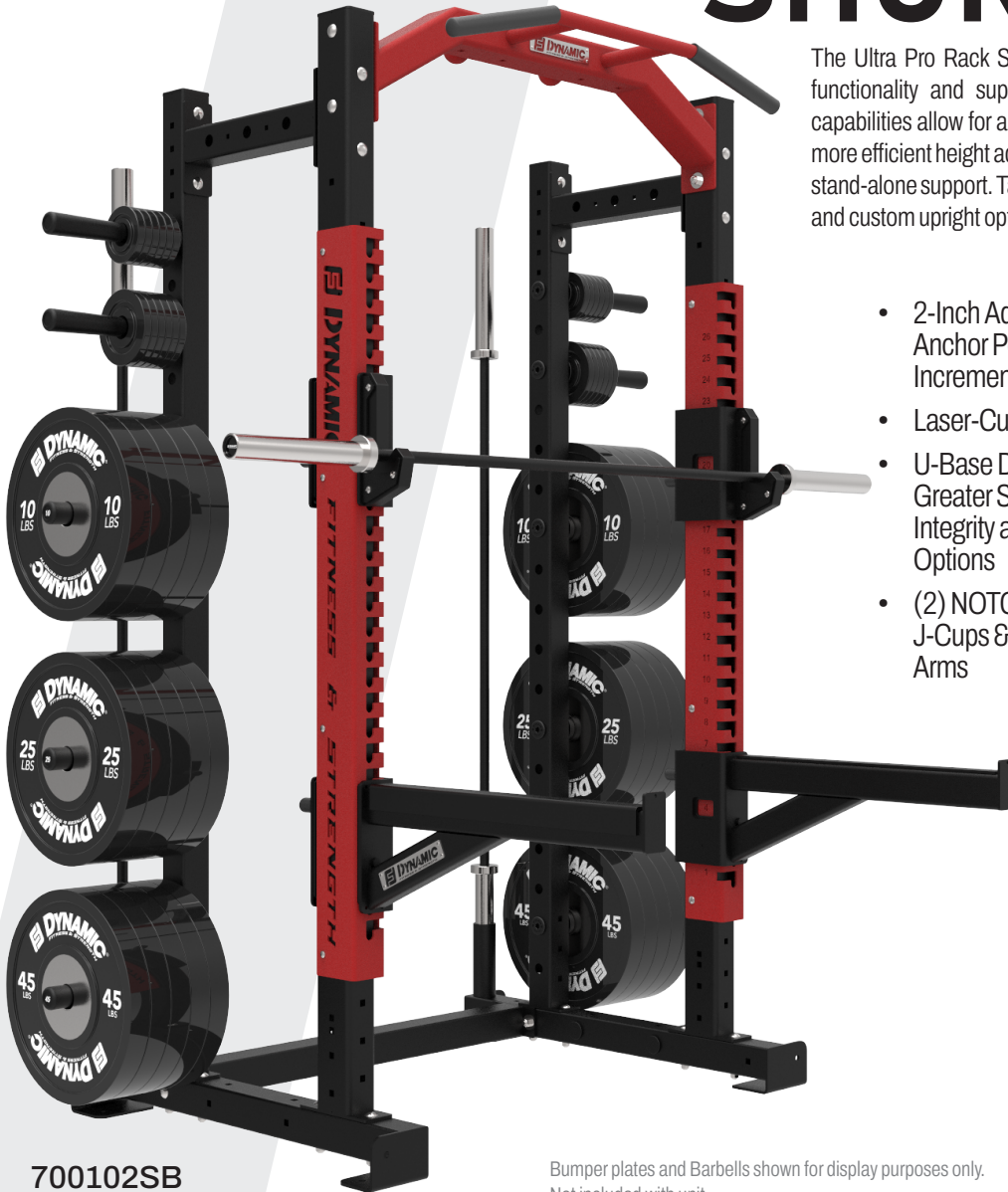
700102SB features powder-coated upright wraps

Bumper plates and Barbells shown for display purposes only. Not included with unit.