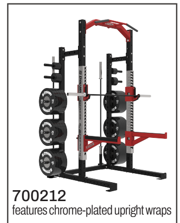
700212 features chrome-plated upright wraps