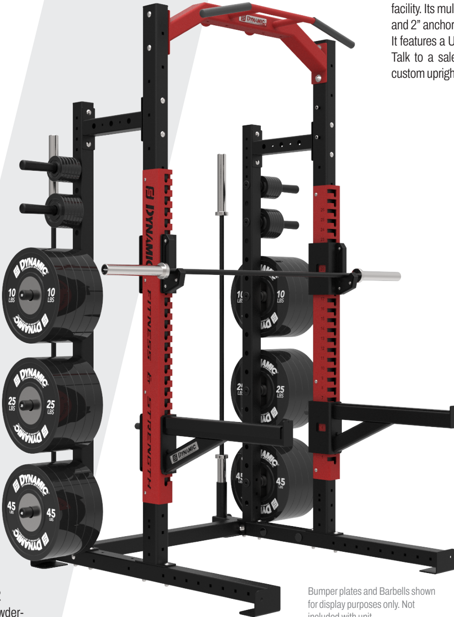
700202 features powder-coated upright wraps