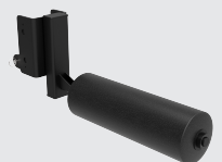
Split Squat Roller